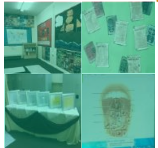
Are those who know equal to those who do not know? Qur'an 39-9

The subjects covered provide a broad range of information that are delivered in effective and creative ways to ensure that the students are challenged as well as enjoying their time learning at the Academy. It is hoped that through these subjects, a platform is provided for the students to engage in all sorts of activities that promote leadership skills and critical and creative thinking, which are some of the skills that we hope the students learn and adopt as they continue with their education.